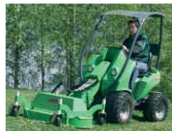
Lawn mower (also with collector)