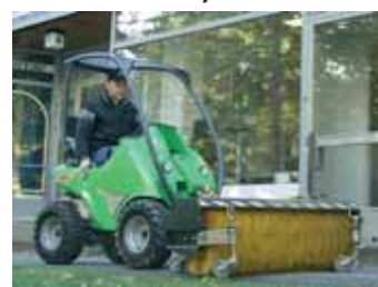
Rotary broom (also with collector)