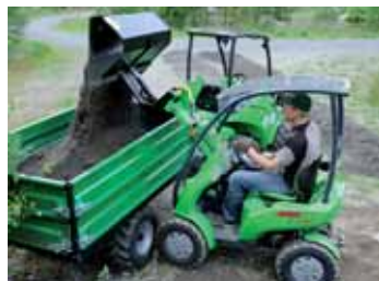
High tip bucket