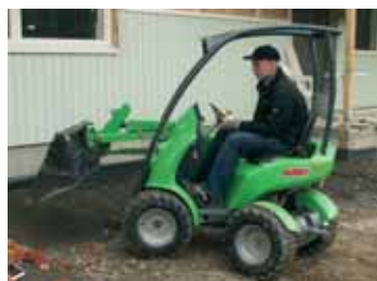
General & light material buckets